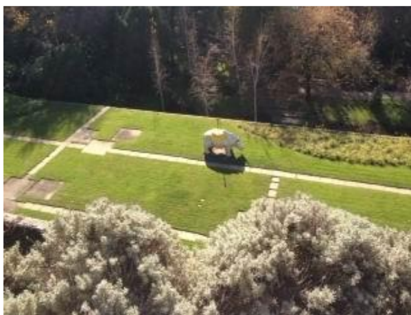
Garden of Foundation Gulbenkian