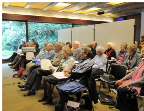
The Workshop's participants