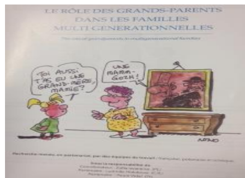
Some pages of IAUTA's new publication